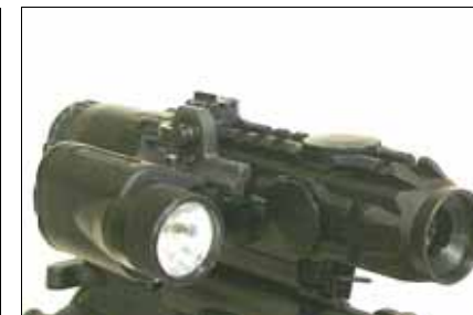
The ARMS 17 mount installs on most any Picatinny rail surface -- shown here on a Leupold CQ/T scope.