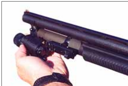
Shotgun I-Mount On Remington