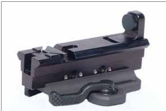
ARMS #17 Mount Recoil Protected Model Shown

IMPORTANT: READ THESE MATERIALS BEFORE YOU USE THIS PRODUCT!