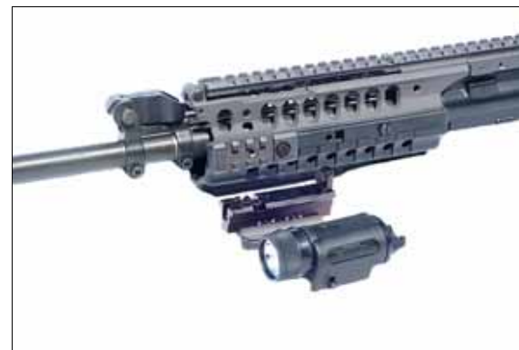
The ARMS #17 mount and light can be carried mounted or dismounted and separated.