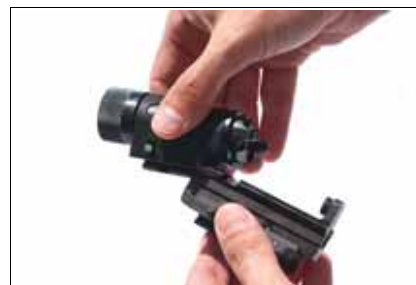
The light mounts and dismounts instantly and without tools.