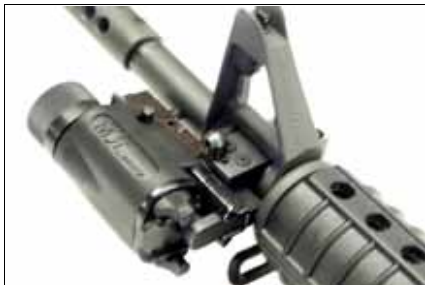
Rifle I-Mount On Colt