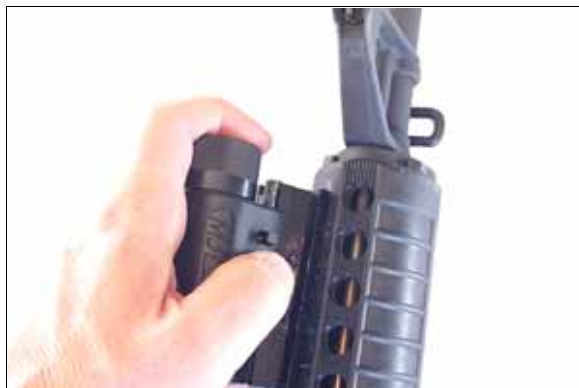
Snap The Light On Firmly

Reverse the process to dismount the light, by lifting the locking bar and pushing the light forward until it clears the rail.