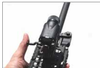
Mount the light on the rail and the rail on a Picatinny Rail surface.