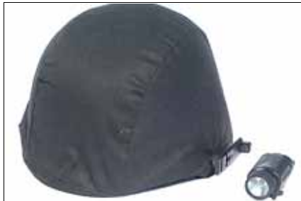
Helmet Mount For Hands-Free Search

The LIGHTLINK ARMS #17 Mount permits you to mount Streamlight, Glock, and Laser Devices tactical lights, Springfield Armory tactical lights (requires a rear block spacer), or Surefire's X200 or Millennium lights (requires a different locking bar). The LIGHTLINK ARMS #17 Mount will also permit you to mount, when using the LIGHTLINK Universal Adapter, other common firearm accessories.