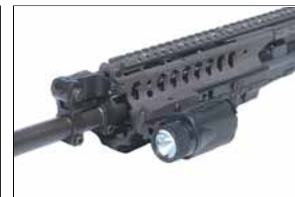
The thumb switch will be located for easy access from the forearm..